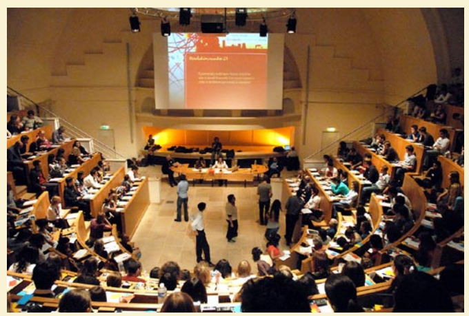
Final assembly of the delegations in Paris

Contact: Norbert Steinhaus, norbert.steinhaus @wilabonn.de