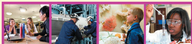
Public Attitudes to Science 2011

More details: http://www.ipsos-mori.com/researchpublications/researcharchive/2764 / Public-attitudes-to-science-2011.aspx