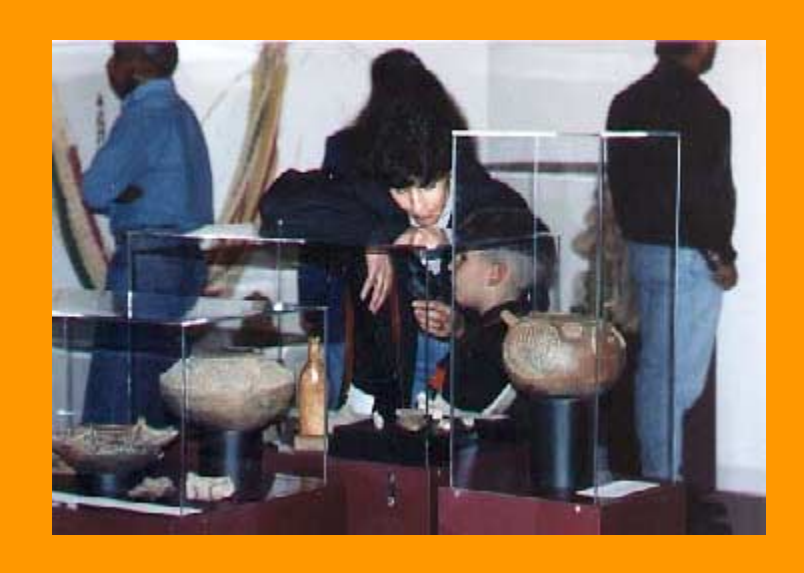
Exposition of Contemporary Taino Identity through Art, Language and Artifacts