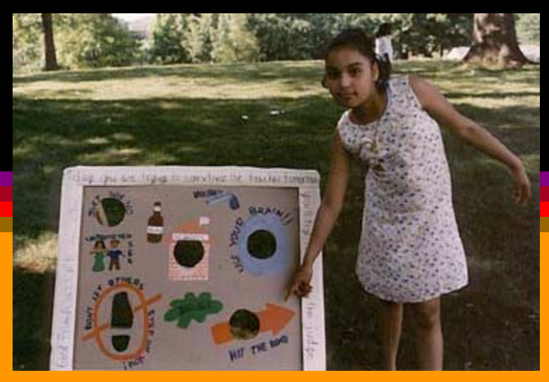
UWASA girl showing off her research based prevention tools