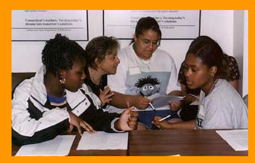
NTARC youth working on body Mapping